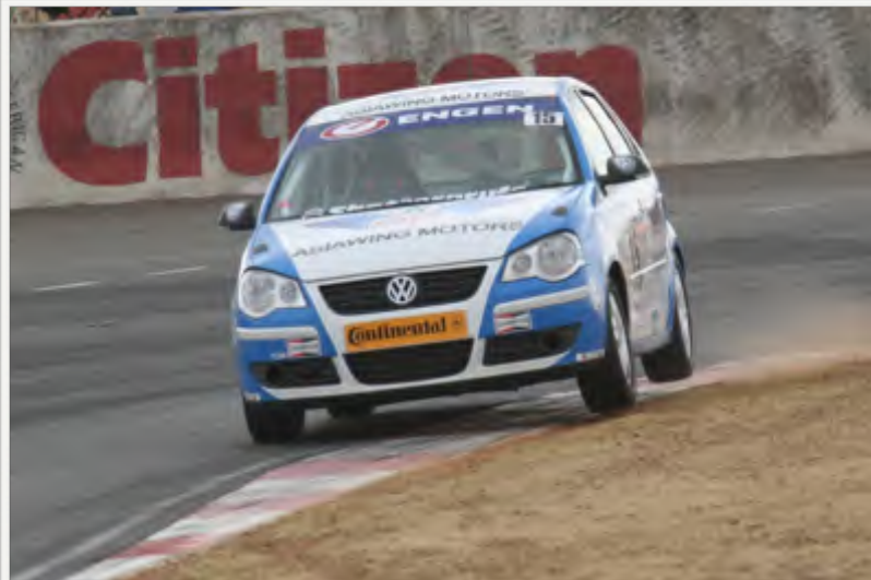
Pole position at Wesbank