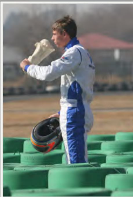
A chain cost him the SA Championship