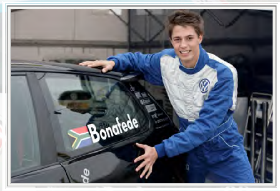
Proud of his new toy