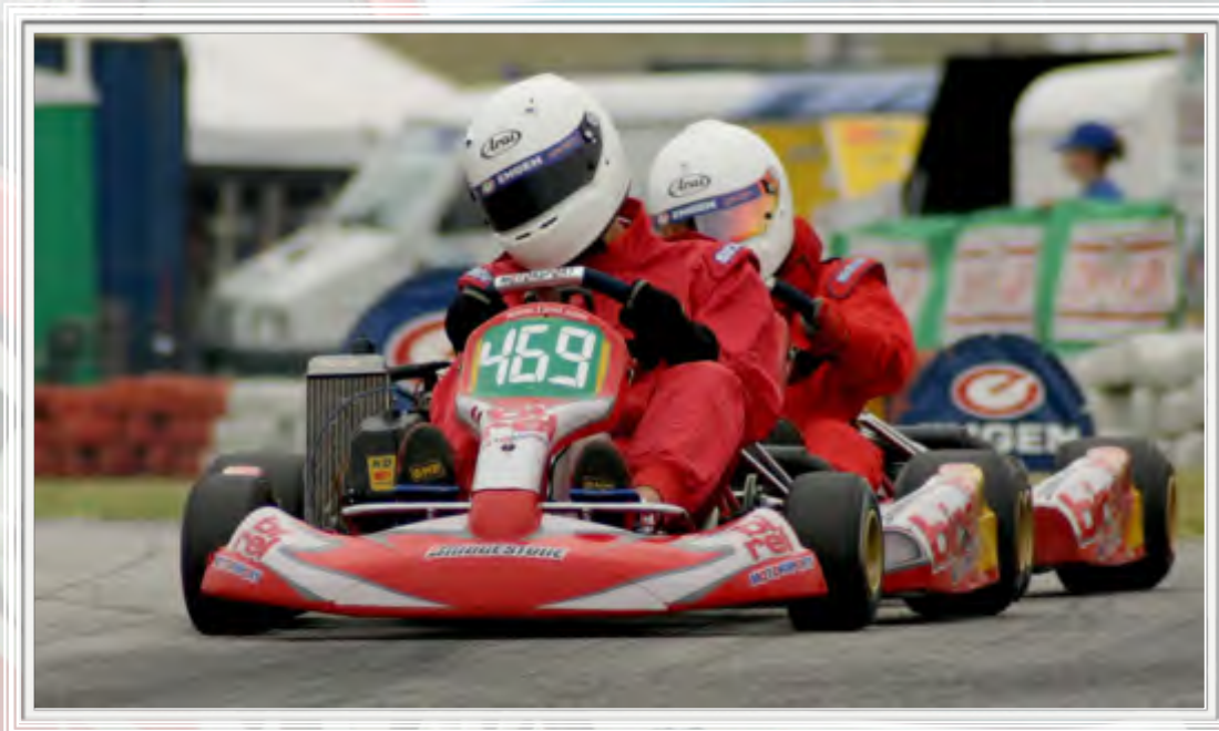
Leading in Junior Max PE National