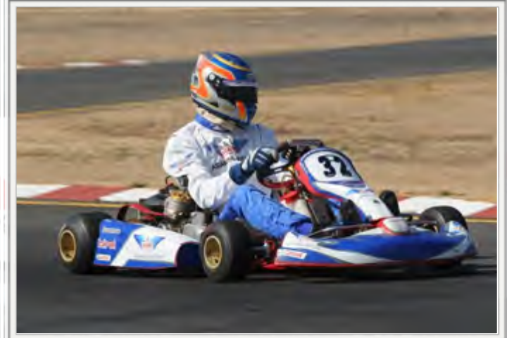
Winning in Vereeniging