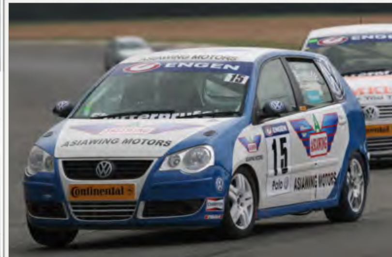
At 16, the youngest Driver ever in Polo Cup