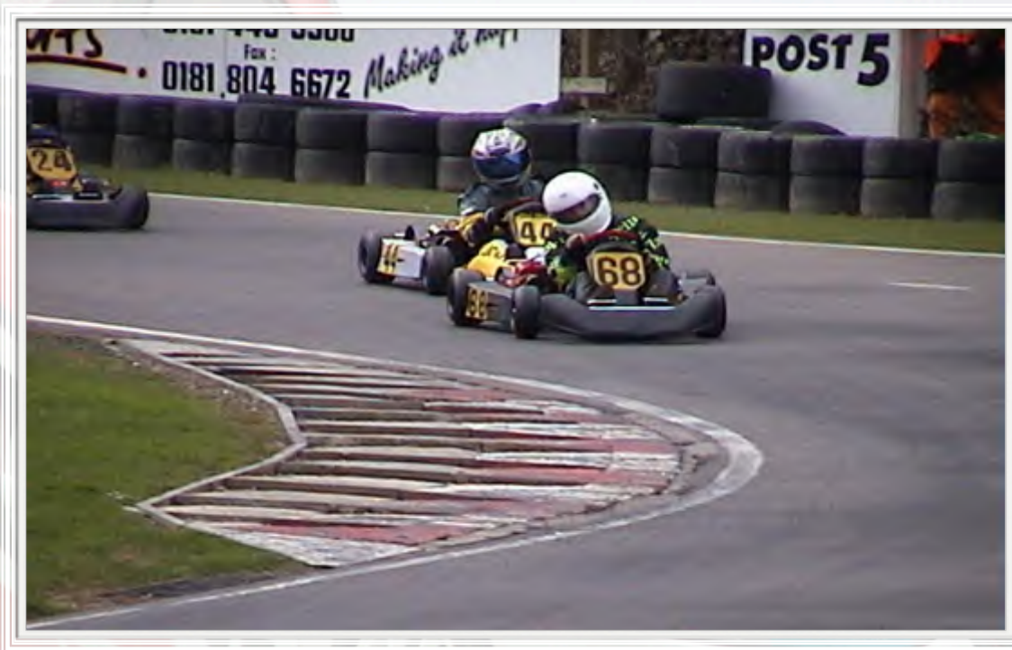
Racing at Buckmore Park, England