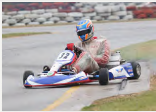
Winning in PE in the rain